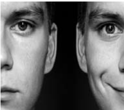
Rising Above Page 4