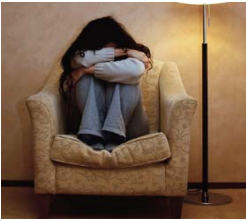
From Reeling to Healing Page 2

Offering a beacon of hope to the church and the community