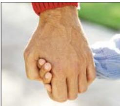
10 Steps to Positive Parenting Page 3