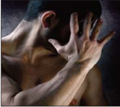
From Fantasy to Eternity Page 2