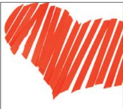
Divorce Care Page 3