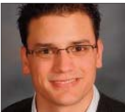
Sad Farwell Page 3