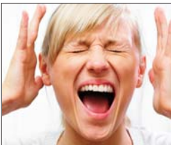
Overwhelmed! Page 4