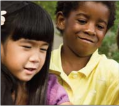
Social Skills Class Page 3