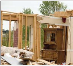
DIRT Help needed Page 2